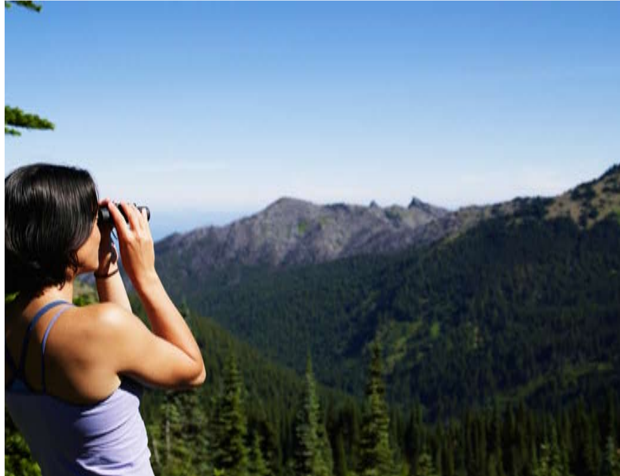
The Northwest offers wildlife watchers myriad opportunities to spy on animals (above)—just don't get too close. Roosevelt elk cows spar in the midst of a wintering herd (below).

But the very best wildlife experiences take place out in the countryside where the animals are most at home, the environment enhances the experience considerably, and you can do yourself some good while you're at it. Please, get out of the car, go for a walk or paddle a kayak, have a picnic, camp by a mountain lake. The more that you do outdoors, whatever it is, the more animals you will see.