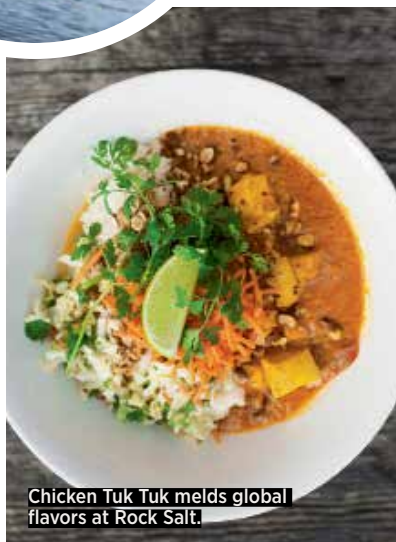
Chicken Tuk Tuk melds global flavors at Rock Salt.