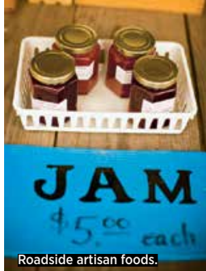
Roadside artisan foods.