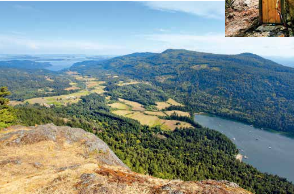
Clockwise from left: Views from Mount Maxwell Provincial Park are tough to top; a trailside fairy door; the island boasts 350 apple varieties; camping with a view at Ruckle Provincial Park